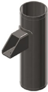
2 – 12"/DN50 – DN300