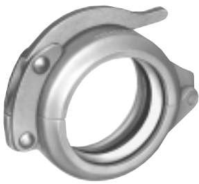
2" (50 mm) Size

Style 78A Snap-Joint coupling provides a quick disconnect joint. Mated housings are hinged with an attached locking handle for assembly.