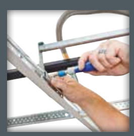
Tighten bracket to ceiling grid