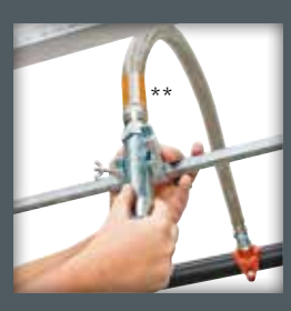
Position sprinkler in bracket

* Does not imply complete installation instructions consult the appropriate Victaulic installation and maintenance documentation.