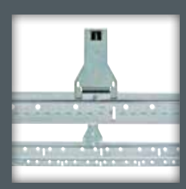
Marks on bracket to easily center sprinkler in tile