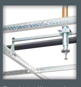
Bracket will not obstruct tile placement