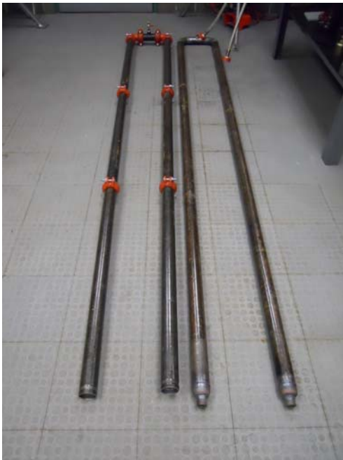
Picture 1 Piping Layout

A test simulating a hydronic heating system was developed. Dissolved oxygen in the water was continuously measured on both welded and grooved systems in which 40°C water continuously circulated.