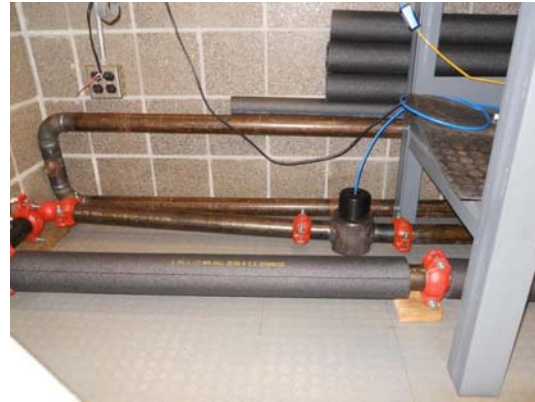
Picture 3 Oxygen probe

Fresh tap water of 20°C was introduced in the piping systems and was heated to and maintained at 40°C during the test.