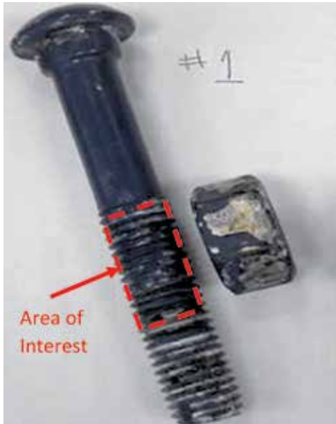
Figure 4: Victaulic fluoropolymer-coated hardware after 1000hr C5-M salt spray testing