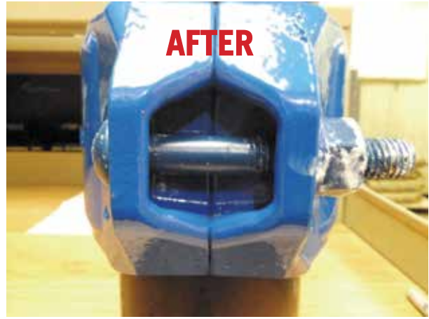
Figure 3b: Style 905 assembly after the 1000-hr C5-M salt spray testing