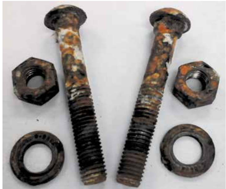
Figure 5: Zinc-electroplated carbon steel hardware after 1000hr C5-M salt spray testing

In order to predict the long-term performance of Victaulic's couplings in a severe corrosive environment, evaluation of Victaulic fluoropolymer-coated hardware exposed in the C5-M environment was conducted. The methodology to estimate the total thickness loss of fluoropolymer-coated zinc-electroplated carbon steel hardware follows an established corrosion prediction model from ISO 9224. 5 The model is based on three factors: (1) first-year corrosion rate of fluoropolymer coating, calculated from ISO 12944-6 testing, (2) logarithmic corrosion rate for carbon steel base metal, for exposure up to 20 years in duration and (3) a linear corrosion rate for carbon steel base metal, for exposure of more than 20 years. This conservative approach does not take into account the added corrosion protection from the zinc electroplating. The first-year corrosion rate is based on the accelerated salt spray testing.