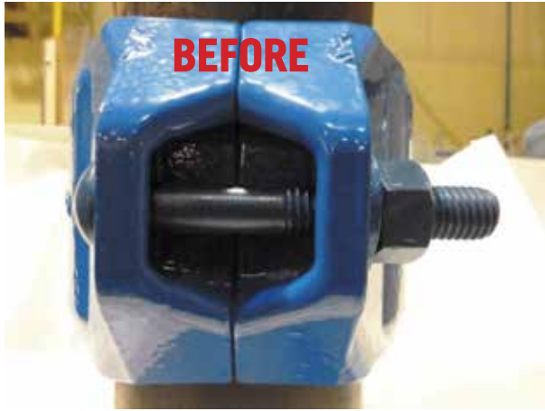
Figure 3a: Style 905 assembly before the 1000-hr C5-M salt spray testing